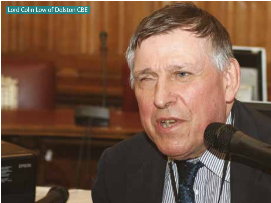
Lord Colin Low of Dalston CBE